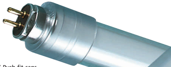
T5 CLRE Push fit caps

■ The Encapsulite clear safety sleeves have been widely used throughout the food and associated industries since 1969. Designed to protect personnel and equipment in the event of lamp breakage.