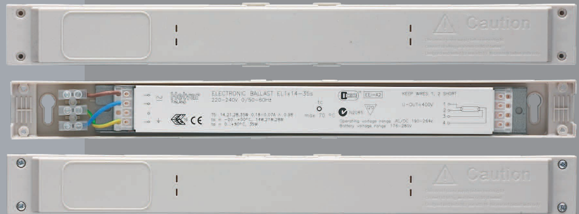
HW/S ballast pictured, twin and dimmable available

Please see overleaf for installation and maintenance advice.